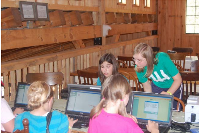
MTL set-up at Vala's Pumpkin Patch for making cards for our soldiers overseas.

The Mobile Tech Lab (MTL) has been out and about at various events.